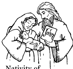
Nativity of St. John the Baptist

Sunday: Twelfth Sunday in Ordinary Time Monday: The Nativity of St. John the Baptist Thursday: St. Cyril of Alexandria Friday: St. Irenaeus Saturday: Ss. Peter and Paul