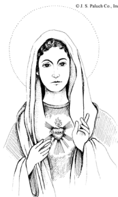
Immaculate Heart of Mary