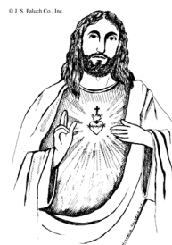
Most Sacred Heart of Jesus