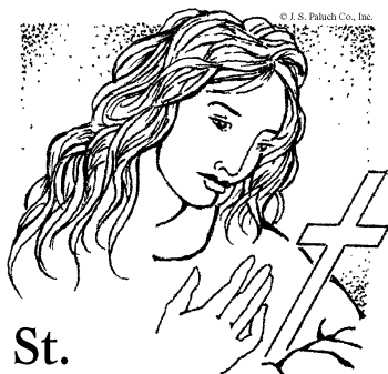
St. Mary Magdalene

Sunday: Sixteenth Sunday in Ordinary Time Monday: St. Mary Magdalene Tuesday: St. Bridget Wednesday: St. Sharbel Makhlūf Thursday: St. James Friday: Ss. Joachim and Anne Saturday: Blessed Virgin Mary